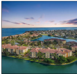
Vivante, Punta Gorda Storm Damage Assessment