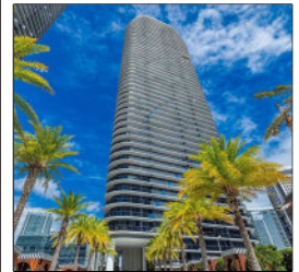
SLS Lux Condominium, Miami Turnover Study