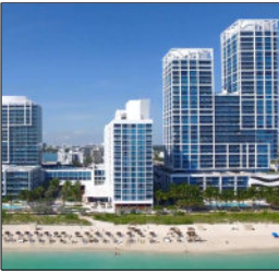
Carillon Hotel, Miami Storm Damage Assessment