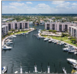
Yacht & Racquet Club of Boca Raton Structural Integrity Reserve Study