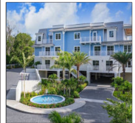
Residence Club, Key Largo Capital Reserve & Milestone Survey