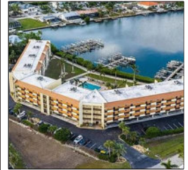
Hickory Harbor, Naples Storm Damage Assessment