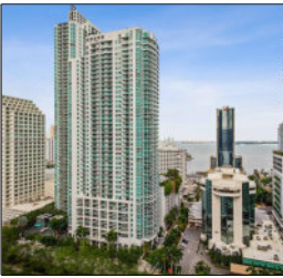
1010 Brickell, Miami Turnover Study