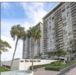
The Charter Club, Miami Building Recertification & Deck Repairs