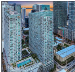
Axis on Brickell, Miami Façade Restoration and Paint