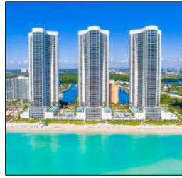
Trump Tower II, Miami Façade Restoration and Paint