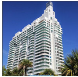
Southpointe Tower I, Miami Milestone Inspection Survey